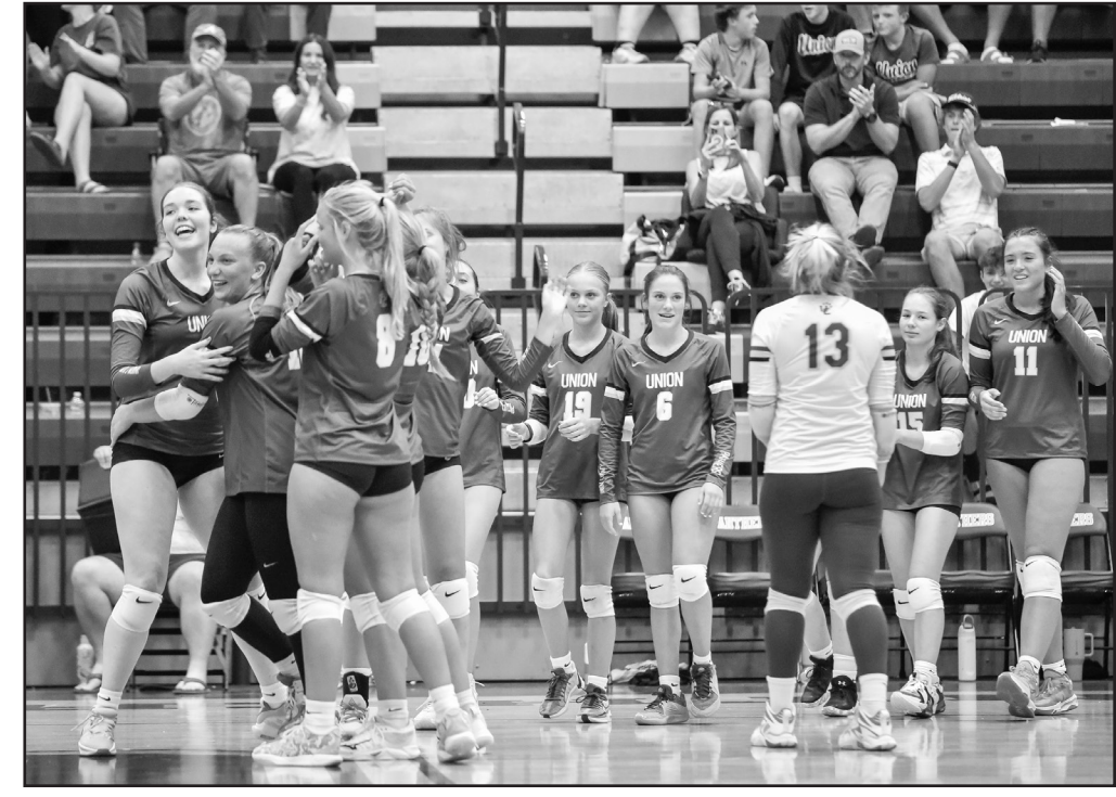
Union County celebrates its win over Rabun County.